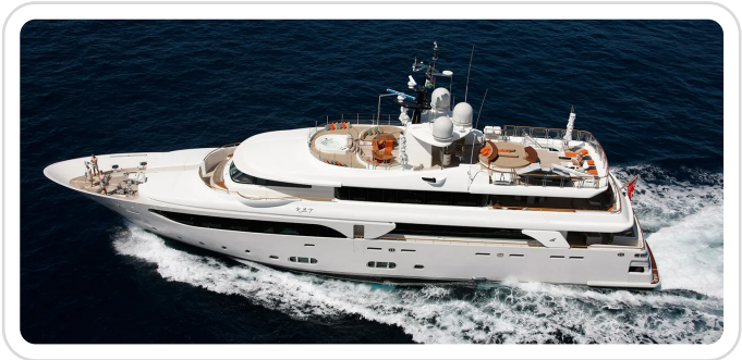
CRN Motor Yacht Avant Garde 2 Sold