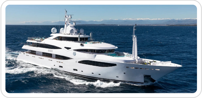
60m CRN Ramble On Rose Finds New Owner