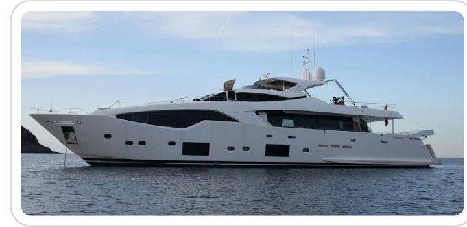
Ferretti motor yacht Aynur'a sold